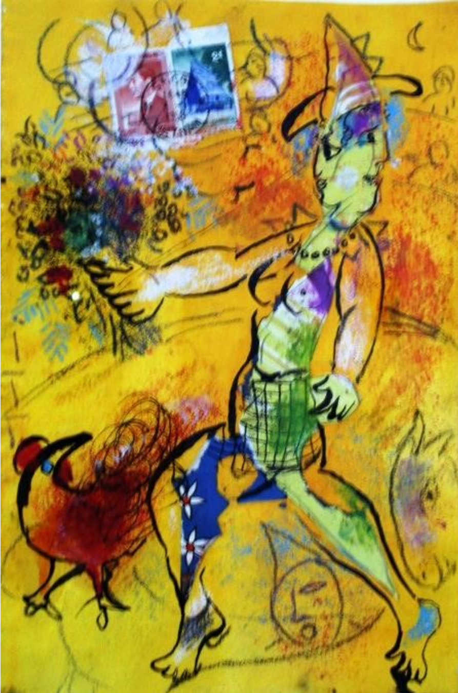
Marc Chagall, (1887— 1985)

And in 1958, in a speech at the University of Chicago he said: "Life is clearly a miracle. We are parts of this life and we pass, with age, from one form of life to another... a man can never technically or mechanically learn all the secrets of life. But through his soul he is connected with the world, in harmony with it, perhaps even unconsciously."