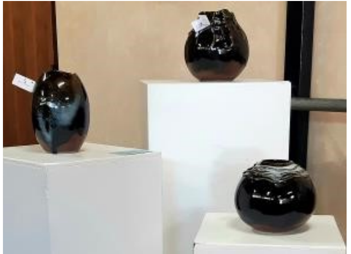
Tenmoku/chun glazed vases by Bronwyn