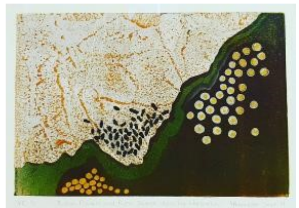
3) Liz Harriott