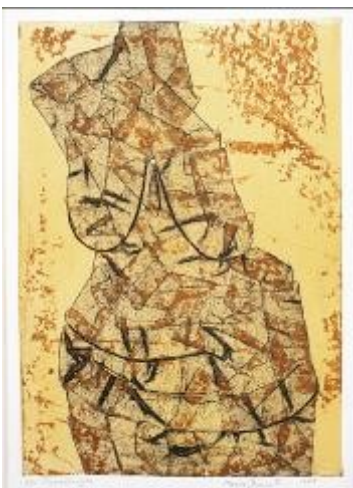
1) Maeve Dunnett