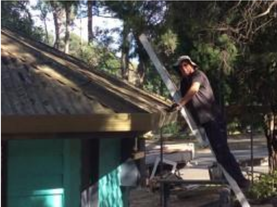
Clearing the gutters